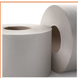
Tissue paper rolls